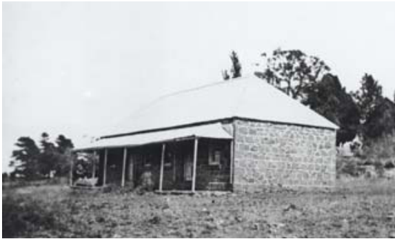
The Lutheran School at Westgarthtown (Thomastown) 1855-1876